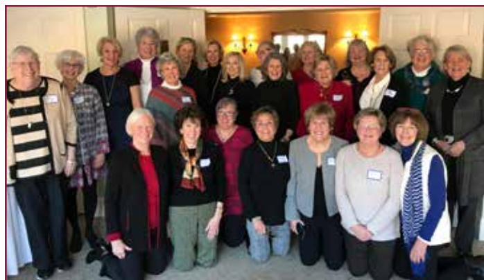
Ladies Luncheon Class of 1961

Classes of 1948, 1963, 1993, 2008, 2013. We do not have information about your class reunion! If you do, please let us know! If you would like to organize your reunion, we can help!